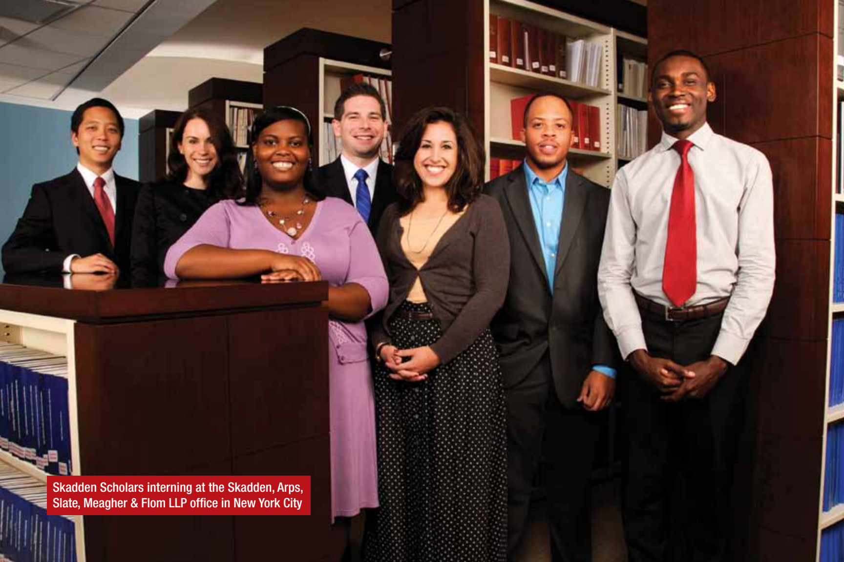
Skadden Scholars interning at the Skadden, Arps, Slate, Meagher & Flom LLP office in New York City